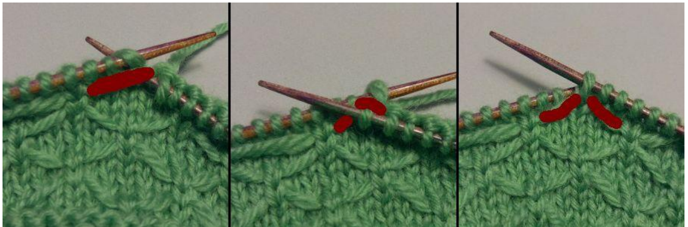
Image below shows q1 stitch (with the loose strand carried in front highlighted in red):