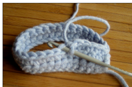
SC the inside loop

Round 6 - (sc in next 2 sts, 2 sc in next st) around = 42