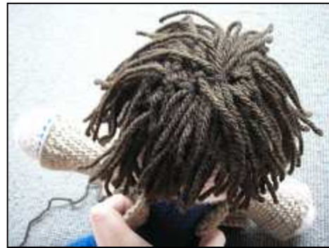
Hair positioned on head

Take hold of a chunk of hair at the front, using some from either side of the part