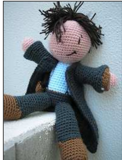
example of overcoat on Jack