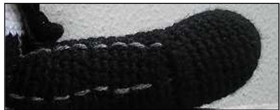
leg with added pinstripes