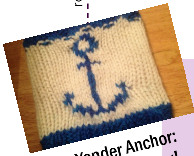
Hoist Yonder Anchor: a nautical mug cozy!

My best friend loves coffee and anchors. I decided to knit a cute little mug cozy with an anchor on it to combine these two loves. Here's the pattern so you can do the same! :)