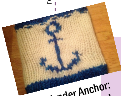
Hoist Yonder Anchor: a nautical mug cozy!

My best friend loves coffee and anchors. I decided to knit a cute little mug cozy with an anchor on it to combine these two loves. Here's the pattern so you can do the same! :)