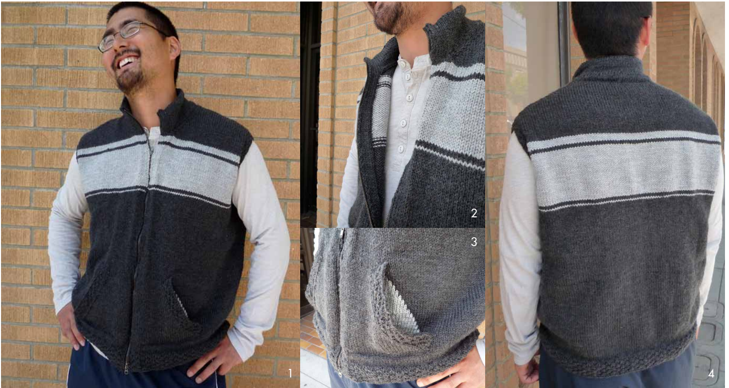
1) A full frontal view of the sweater. 2) A detail shot of the zipper facing. 3) The contrast pocket lining is a fun touch. 4) A full back view.

What could be knit for a man to be worn throughout almost all seasons, have pockets to carry odds and ends, and go from the golf course to dinner with friends—all while being simple and modern yet interesting enough to knit? Oh yeah, and is easy to care for to boot?