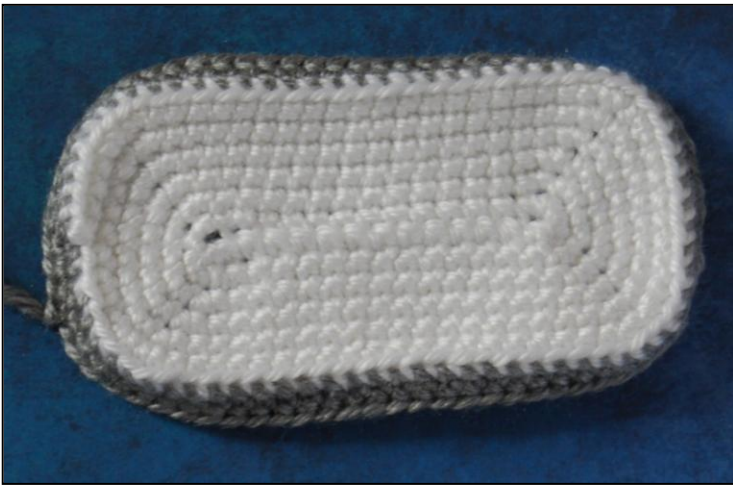
Figure 2: Body with gray band

The front and back body pieces are connected with a grey band that runs along the outside of the phone. To make the gray band, you will need one of the body pieces (it doesn't matter which) and your grey yarn.