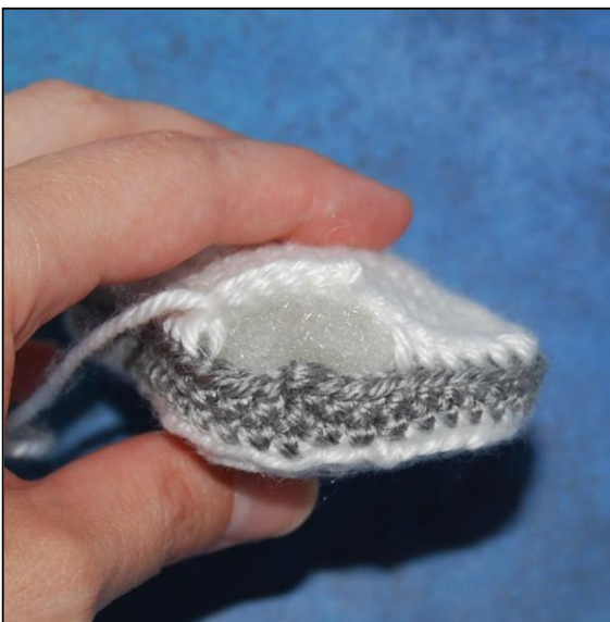
Figure 5: Stuffing the phone

Step 3: Stuff the phone using about a handful of fiber fill. You want the phone to have some three-dimensionality, but don't stuff it so full that it puffs out.