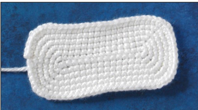
Figure 1: Phone body

The phone body is made in two pieces. To get the oval shape, you will work in the back stitches of the foundation chain and continue from there in rounds.