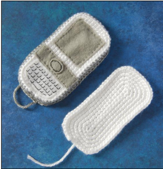
Figure 4: Diagram for attaching felt

Step 1: Sew the felt pieces to the phone body with the grey band as shown in figure 4.