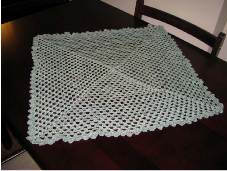
#10 Crochet Cotton in Sage