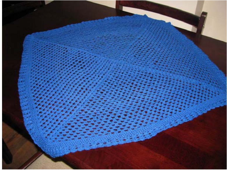
#10 Crochet Cotton in Navy