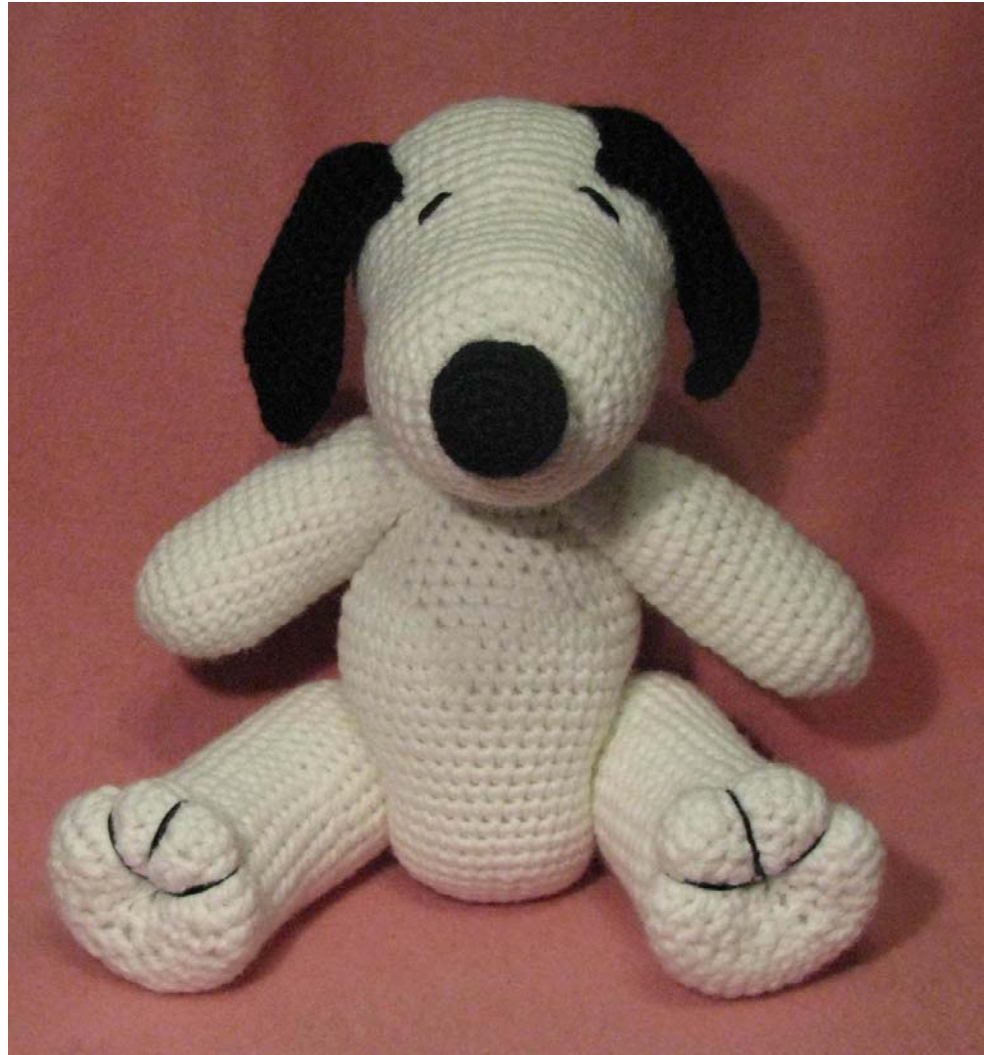
Crocheted Snoopy Look Alike Amigurumi