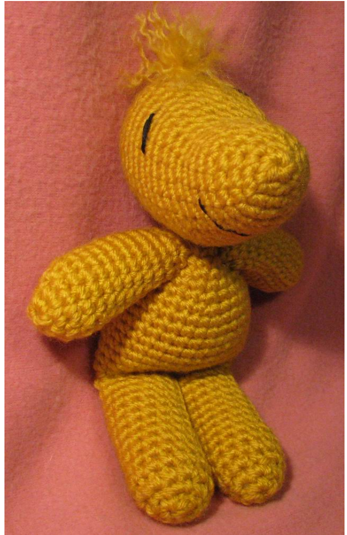
Crocheted Woodstock Amigurumi