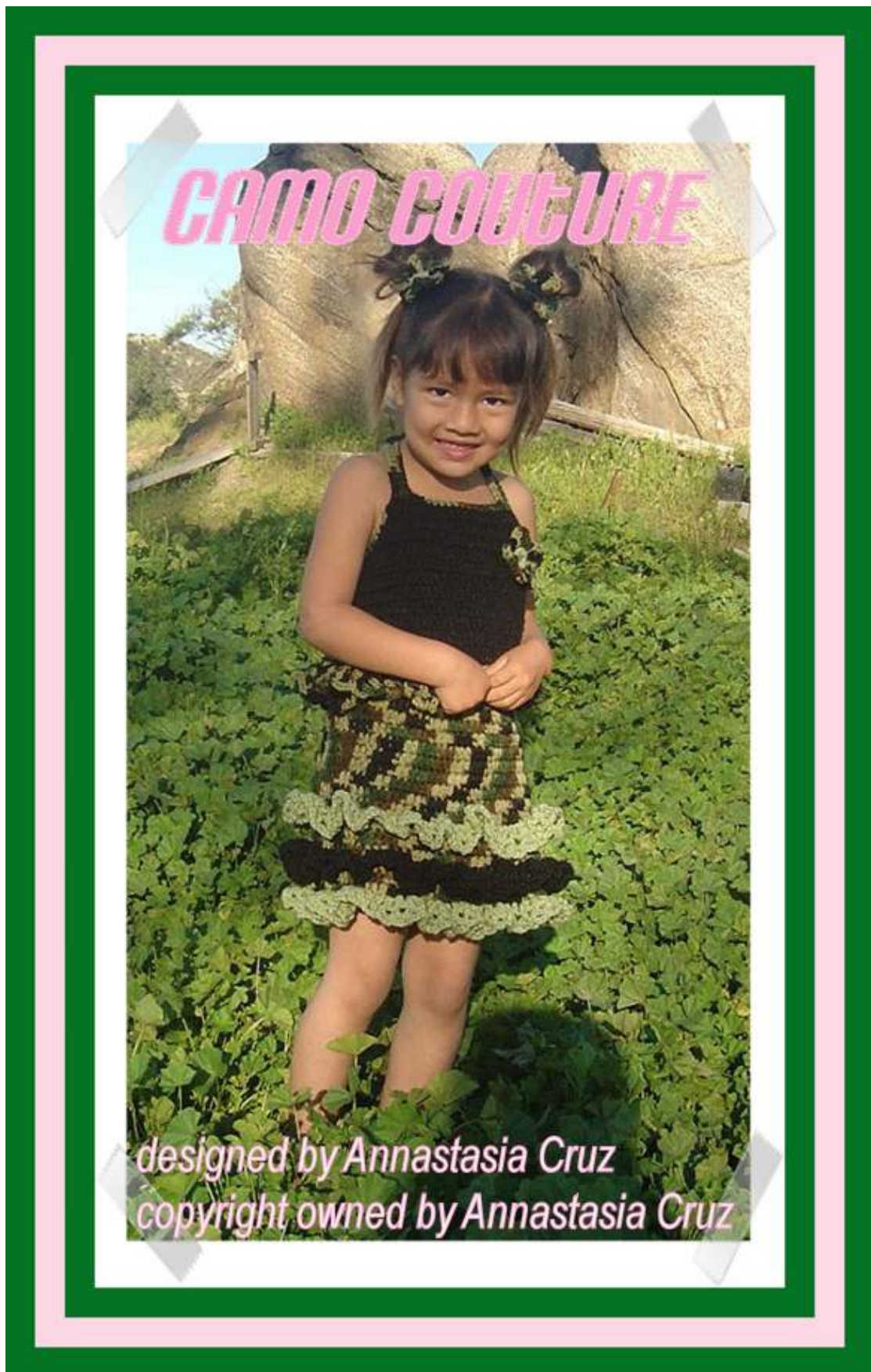
Camo triple ruffle skirt and halter top set