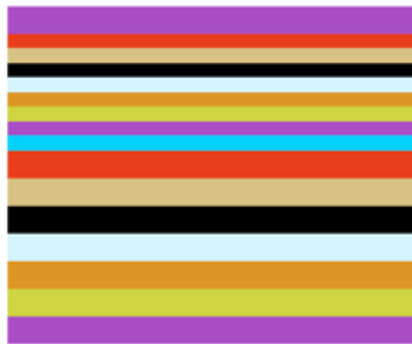
Color Stripe Sequence