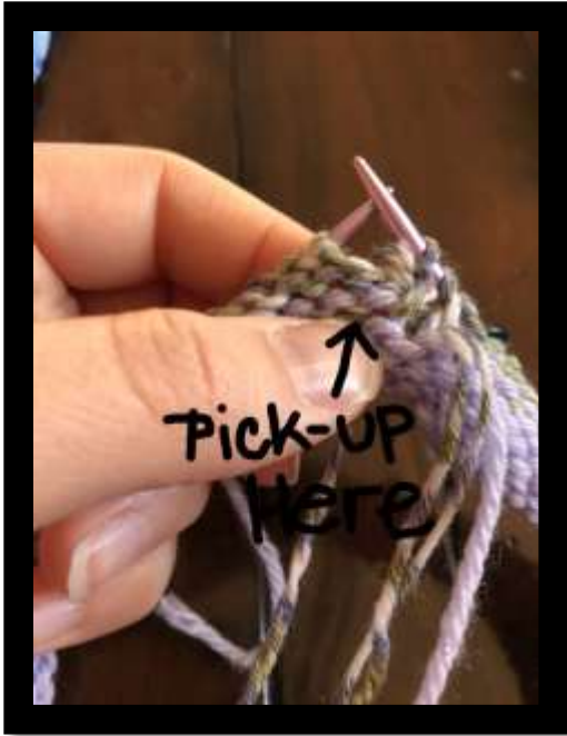
Where to pick-up stitch.