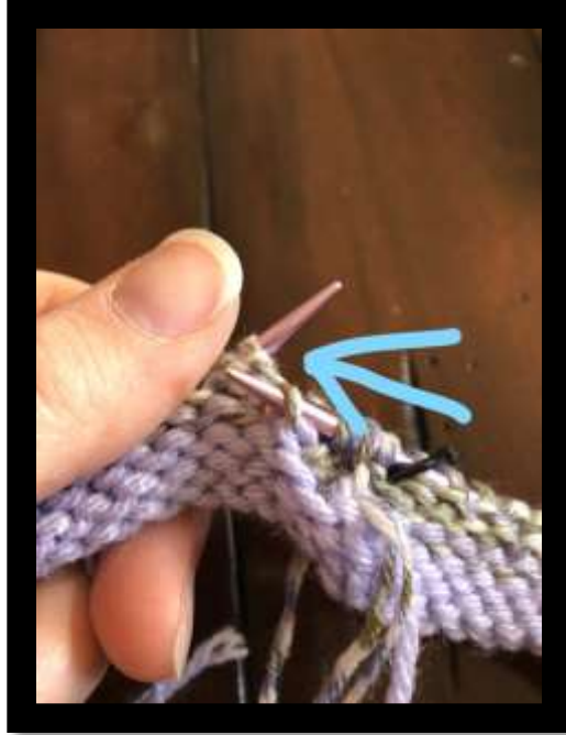
Direction to pick-up the stitch.