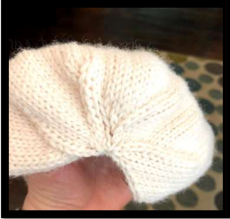
Crown A (folded flat)