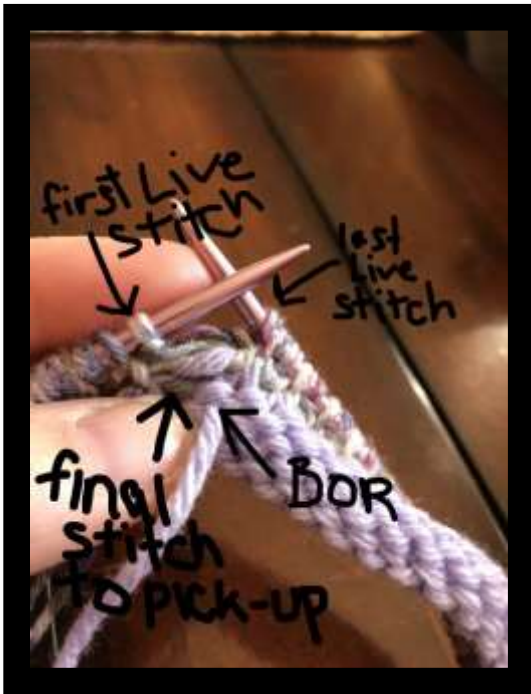
Placements at the end of round.