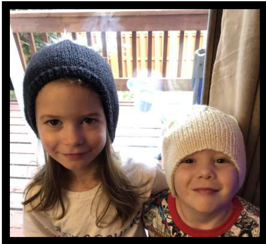
Fits a wide range of head sizes too!

Weave in ends. Lightly block. If desired: attach pom-pom like a BOSS.