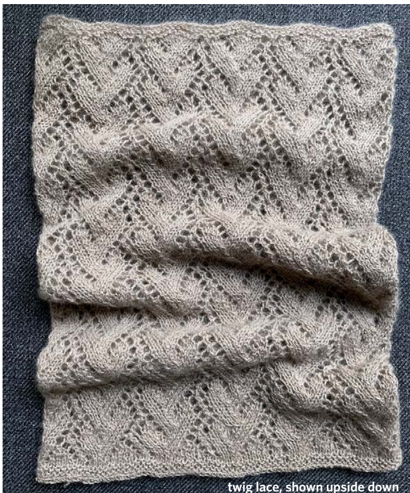
twig lace, shown upside down